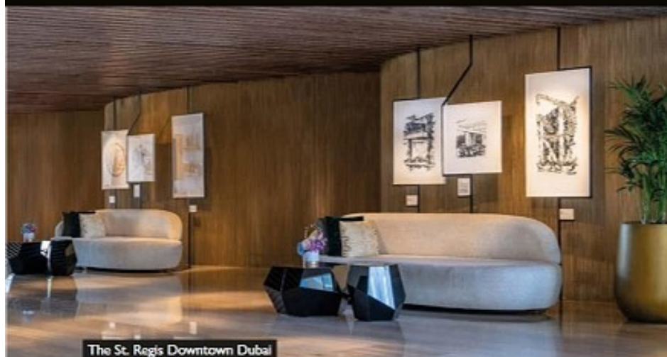
The St. Regis Downtown Dubai