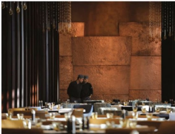
The Address, Downtown Dubai

Award-winning WA International continues to create some of the world's finest interiors including The Address Downtown Dubai, One&Only The Palm Dubai and JW Marriott Absheron Baku.