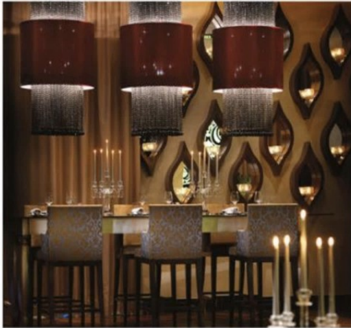
One&Only, The Palm Dubai